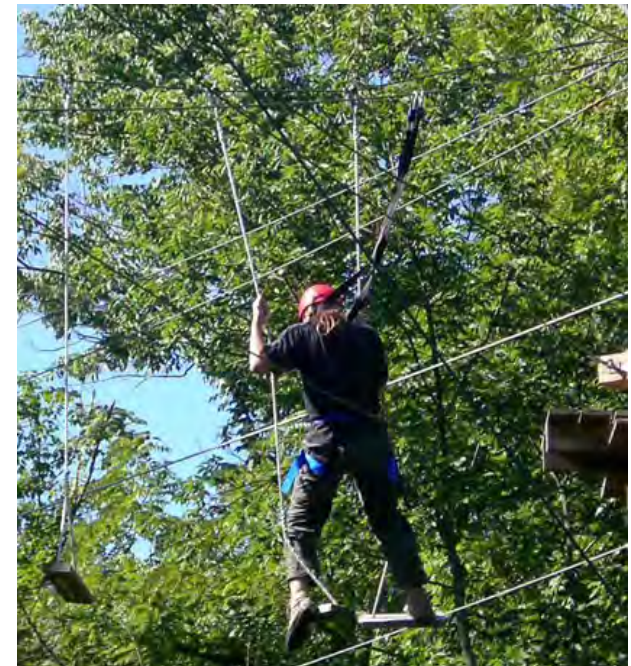
Group sizes of 10 and up - Ages is 13 and older