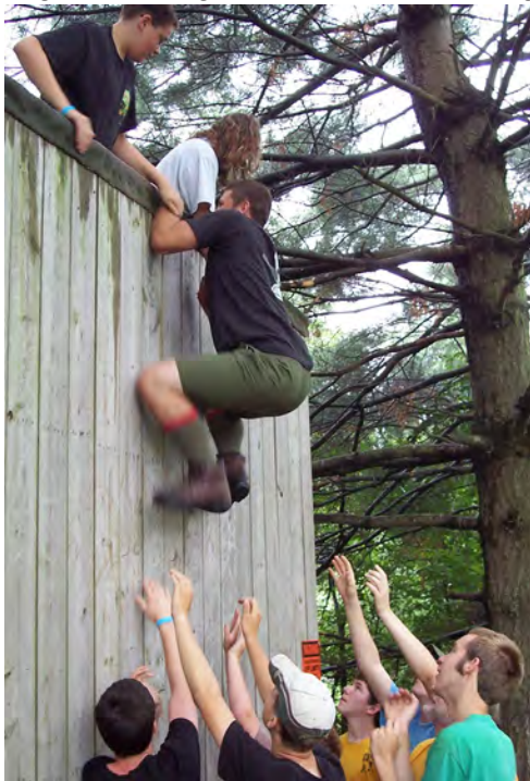
Group sizes of 10 and up - Ages 13 and older

C.O.P.E. is the challenge course program of the Boy Scouts of America. It is a series of physical and mental challenges facilitated by trained staff directed at enhancing personal growth. The recognized goals of the program are: