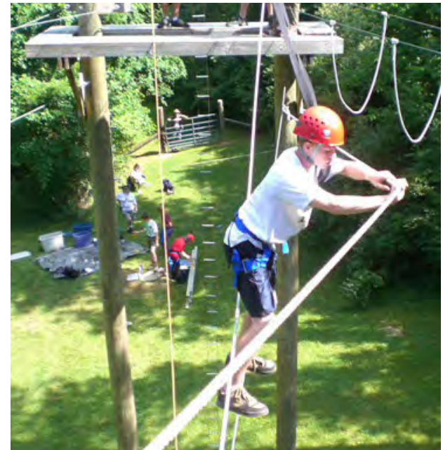
Our 10 element high COPE course safely challenges participants to the next level of self-confidence and fun!