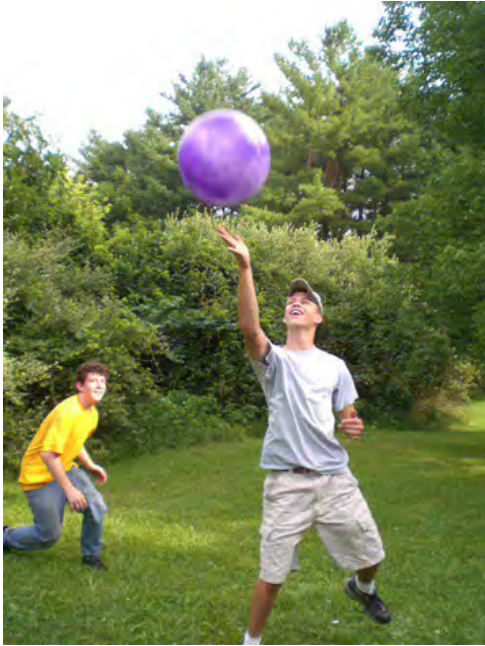
Low COPE works on many team building skills through initiative games and course challenges!